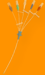
Penta Lumen Coming soon