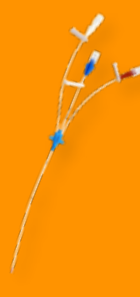
Triple Lumen 4-12 FR