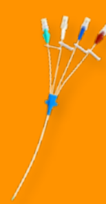
Quad Lumen 8.5 FR